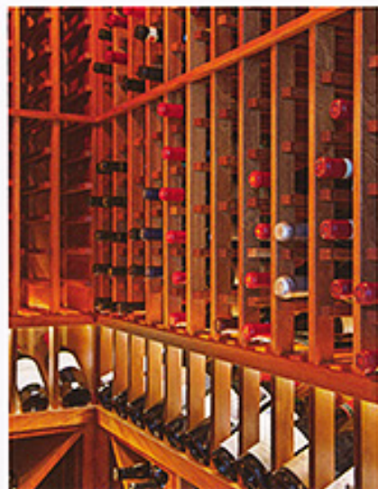
CROWN JEWEL: Tucked into the brick wall of the kitchen, the petite wine cellar holds 950 bottles.