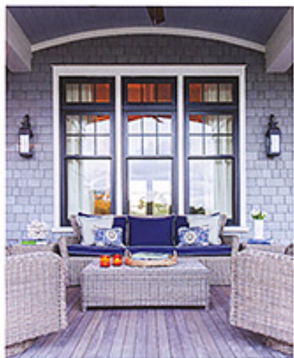
VIEWFINDER: KingsleyBate outdoor furnishings and a bluestone hot tub provide plenty of vantage points for taking in the backyard's creek vistas.

but then we mixed things up with a lot of great materials," she says. In the kitchen, a brick accent wall adds texture and warmth to balance the gleaming wood floors and marble countertops; in the living room, a butted board wall has a similar grounding effect, while the coffered ceiling draws the eye upwards, creating visual interest and subtle drama. And the décor dials things up a notch, too, thanks to posh light fixtures, such as the mirrored number over the dining table, and gilt-framed paintings by local artists such as Chris Groves and Jill Hooper.